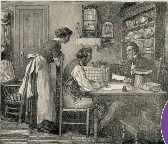
Back in the 1850's, life insurance was limited by law to do little more than offer death benefits.